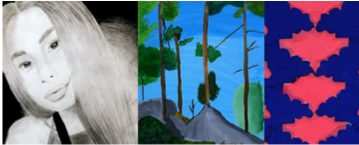
Examples of work from the LA High Student Art Show