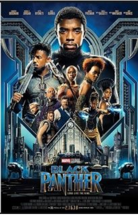
A theatrical poster for Marvel's, Black Panther