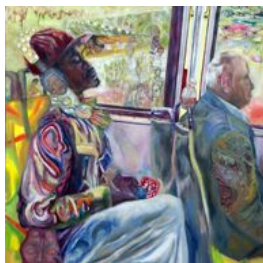
Instadream , 2017 from the Metro Series, oils on canvas 30"x40"